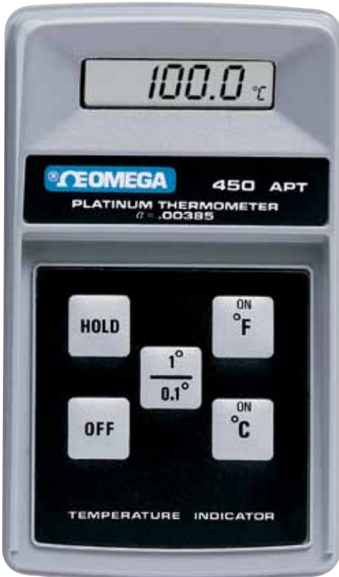
450-APT shown smaller than actual size.