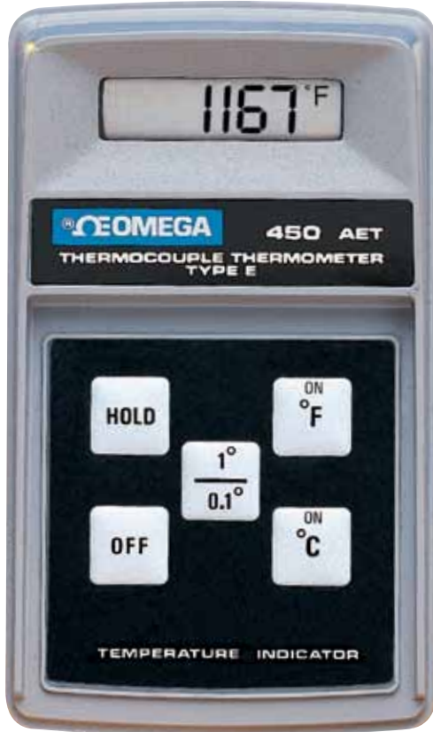
450-AET shown smaller than actual size.