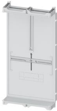
ALPHA-ZS, counter support plate 450mm