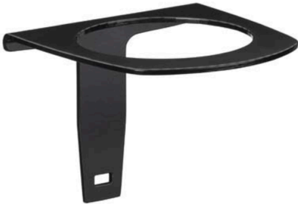
Part no.: 53800131 BTP800M Loop guard