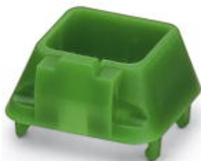
Security frame for SFN switch and patch fields, green

Please be informed that the data shown in this PDF Document is generated from our Online Catalog. Please find the complete data in the user's documentation. Our General Terms of Use for Downloads are valid ( http://phoenixcontact.com/download )