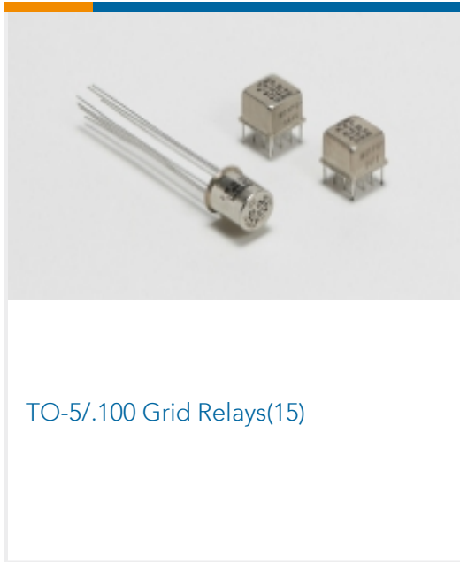
TO-5/.100 Grid Relays(15)