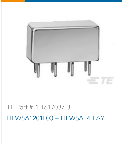
TE Part # 1-1617037-3 HFW5A1201L00 = HFW5A RELAY