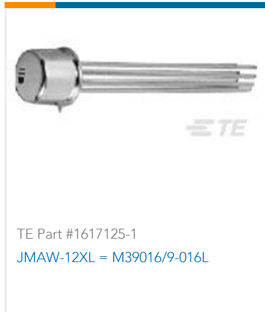
TE Part #1617125-1 JMAW-12XL = M39016/9-016L