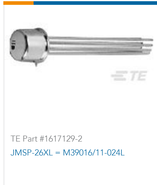
TE Part #1617129-2 JMSP-26XL = M39016/11-024L