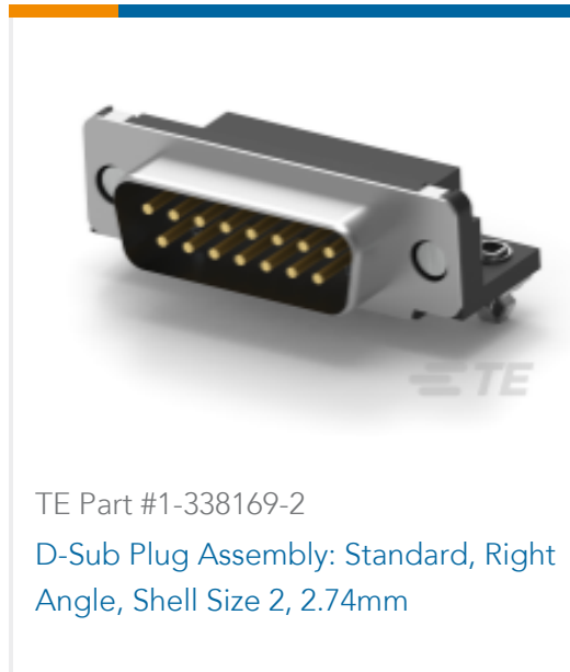
TE Part #1-338169-2 D-Sub Plug Assembly: Standard, Right Angle, Shell Size 2, 2.74mm