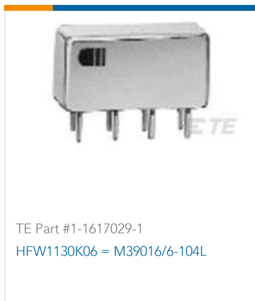
TE Part #1-1617029-1 HFW1130K06 = M39016/6-104L