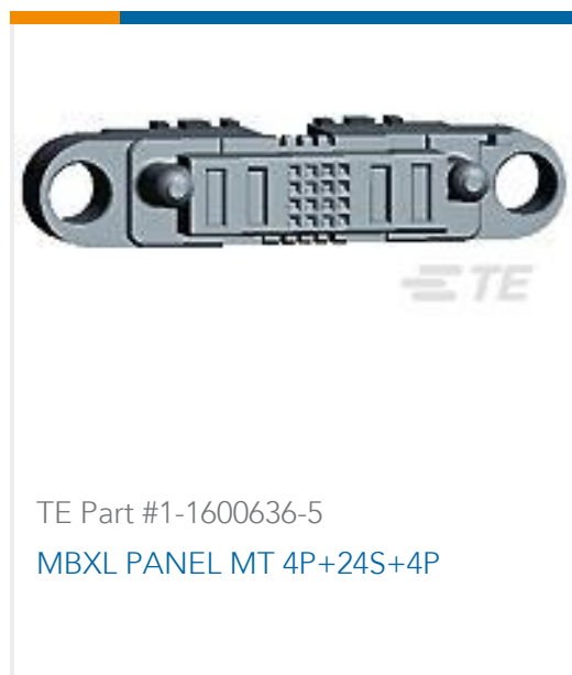
TE Part #1-1600636-5 MBXL PANEL MT 4P+24S+4P