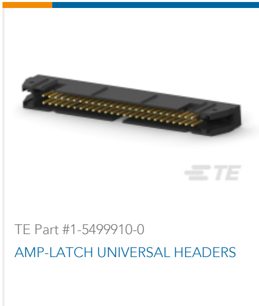
TE Part #1-5499910-0 AMP-LATCH UNIVERSAL HEADERS