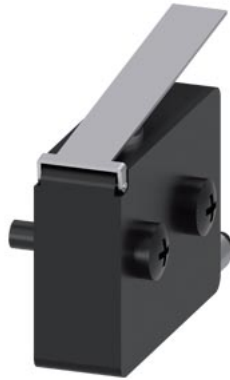
Accessory Circuit breaker 3WA, 2nd Trip alarm switch 1 NO contact (S25)