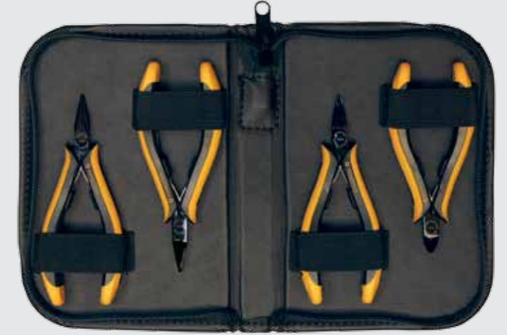
EUROline Outside dimensions: 190 x 135 x 35 mm (closed)