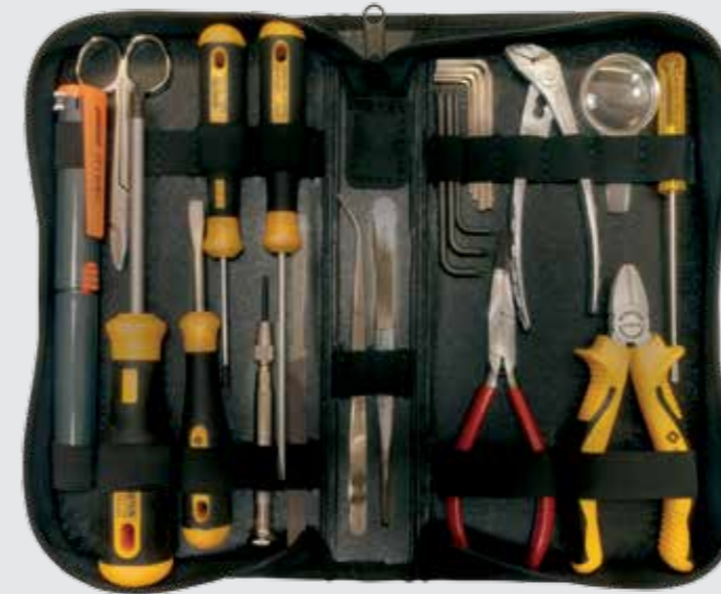
Outside dimensions: 245 x 130 x 60 mm (closed) Weight with tools ?kg