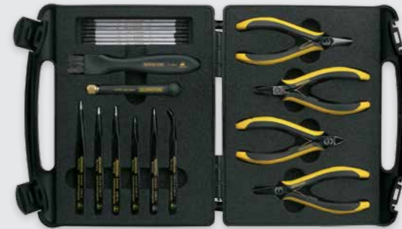
2230 Outside dimensions: 250 x 210 x 60 mm (closed)

The tools are clearly arranged in accurate-sized cutouts in conductive hardfoam.