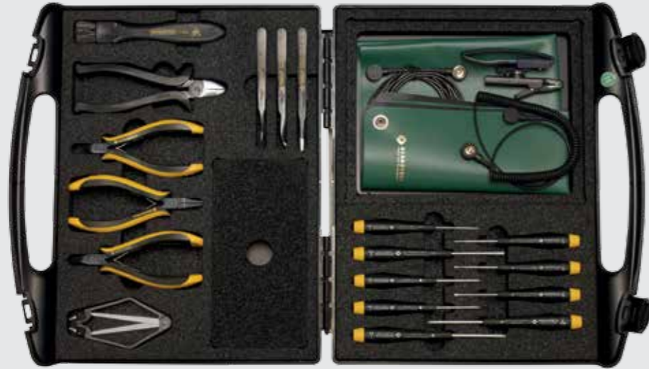
Outside dimensions: 350 x 310 x 65 mm (closed)

the professional kit for ESD-Specialists for local and mobile use