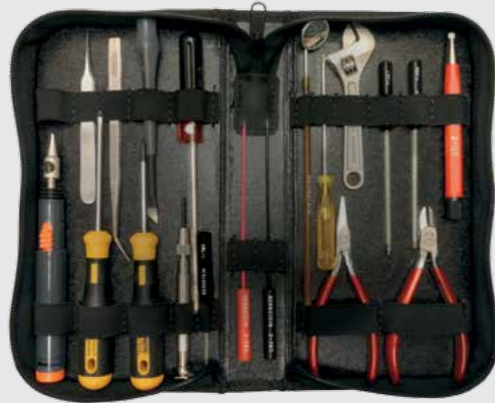
Outside dimensions: 205 x 120 x 50 mm (Mappe closed) Weight with tools 0.680kg

Handy tool case for service-inspection of the electronics engineer