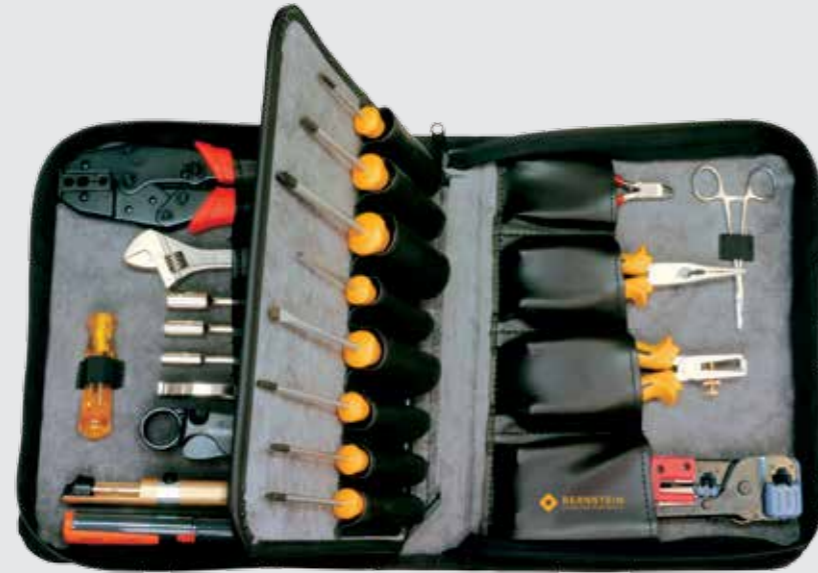
Outside dimensions: 320 x 250 x 100 mm (closed) Weight with tools: ca. 2,750 kg

The set with all essential tools for the assembly and maintenance of networks