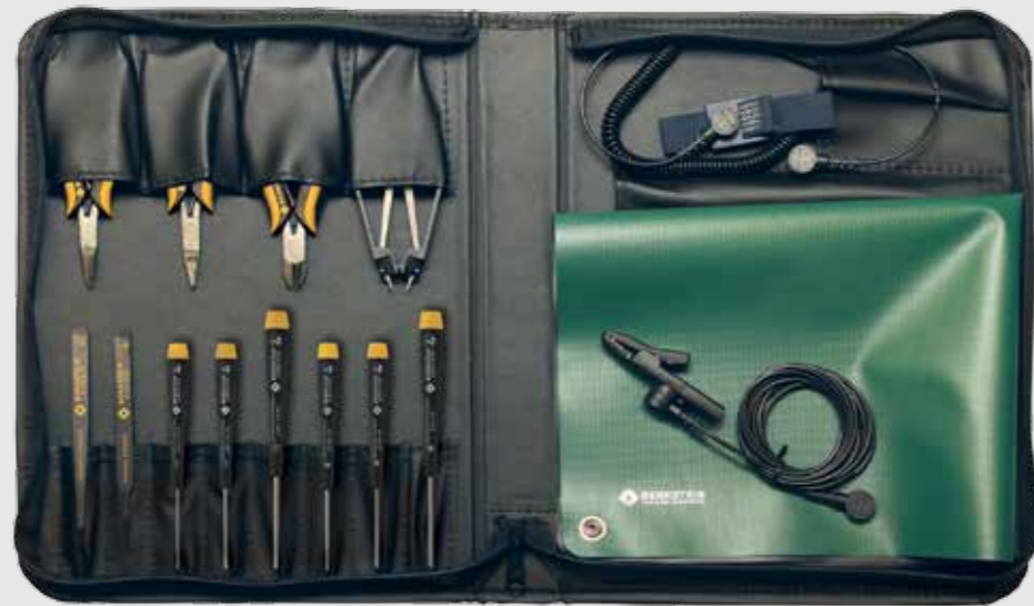
Outside dimensions: 320 x 250 x 50 mm (closed)