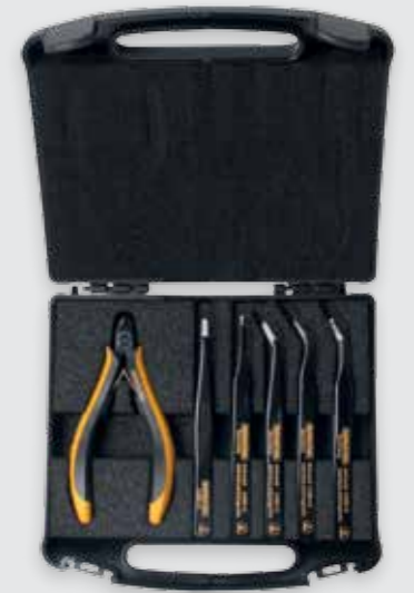
2210 Outside dimensions: 178 x 160 x 42 mm (closed)