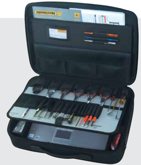
Outside dimensions: 480 x 380 x 140 mm (closed) Weight with tools: ca. 3550 kg

Elegant Laptop and Tool Case made from black nylon, with inside pad and reinforced frame. The bag is divided in 2 zip-fastener bags and has loops on both sides for attaching the shoulder strap. The tray in the upper zip-fastener bag is prepared for the arrangement of a Laptop, together with the necessary accessories, e.g. connector cable, power supply and mouse. The lid of this bag is provided with several pockets for CDs, USB-sticks, writing utensils and documentations. The design 3200 additionally is equipped with a tool tray accurately arranged with 28 special tools. This removable tray is fastened in the case as a swivel-tool-tray with hook-and-loop tape. The bottom zip-fastener bag, with 3 partitions, is mainly provided for documents and literatures.