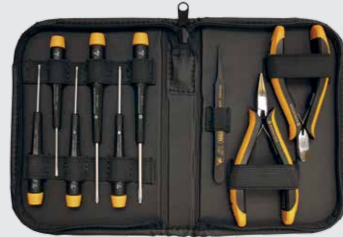
ACCENT Outside dimensions: 190 x 135 x 35 mm (closed)