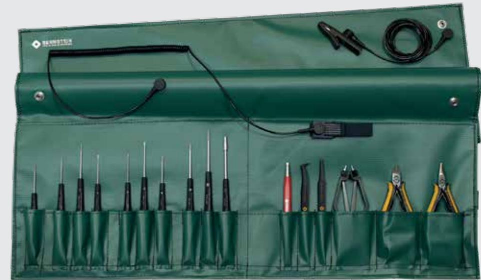
Outside dimensions: 330 x 240 x 20 mm (closed)