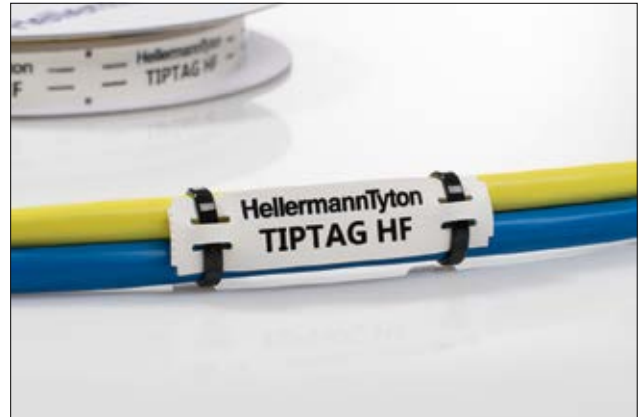
TIPTAG - High performance cable bundle marking.