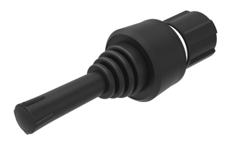
Attention: The preview is based on a sample product. This can differ from your current configuration.