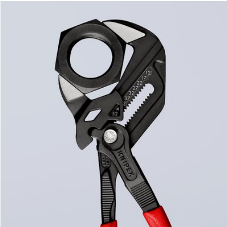
Opening width lasered onto the pliers head (metric on the front and imperial on the back)