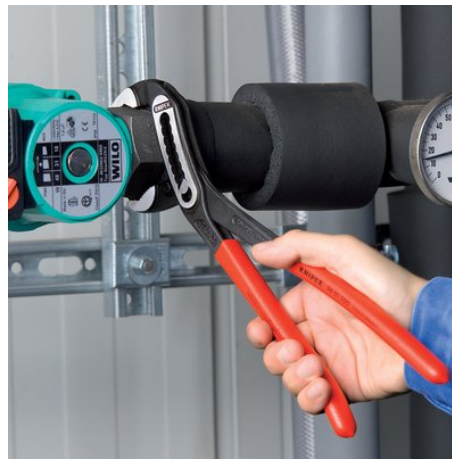
Self-locking on pipes and nuts: no slipping on the workpiece; the complete actuating force can be used to turn the workpieces; not having to squeeze the pliers handles reduces the required effort