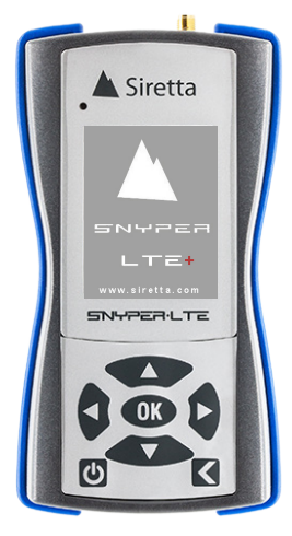
* Neither V1 nor V2 models require a SIM in order to function.

4G/LTE, 3G/UMTS & 2G/GSM Network Signal Analyser