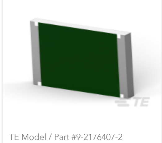
3560 56R 5%