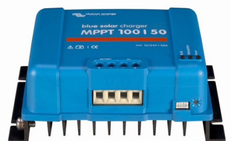
Solar Charge Controller MPPT 100/50