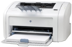
Standard Laser Printer