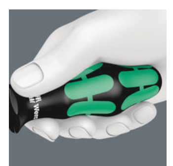
The large contact area – with particularly high friction to the soft zones – results in high torque transfer without any bruising from the edges.