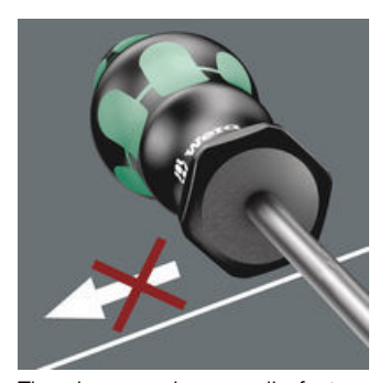
The hexagonal non-roll feature prevents any rolling away at the workplace.