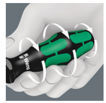
The hard materials used for the handle ensure rapid hand repositioning without any danger of the skin "sticking" to the handle. The surrounding hard zones with large diameters glide like wheels across the hand.