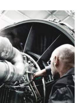
Kraftform Plus screwdrivers – ergonomics you can grasp. They relieve the entire hand-arm system even when used intensively. Along with other technical and product advantages such as the Lasertip for a secure fit in the screw head, Kraftform screwdrivers are the ideal choice whenever manual screwdriving jobs are concerned.