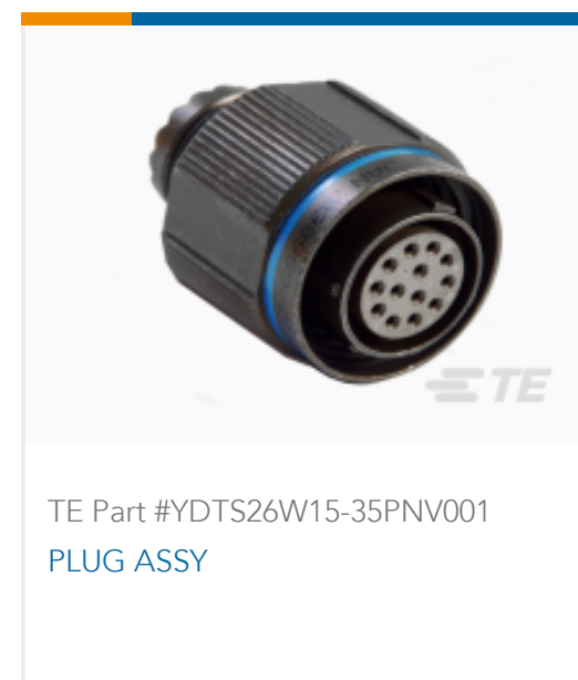
TE Part #YDTS26W15-35PNV001 PLUG ASSY