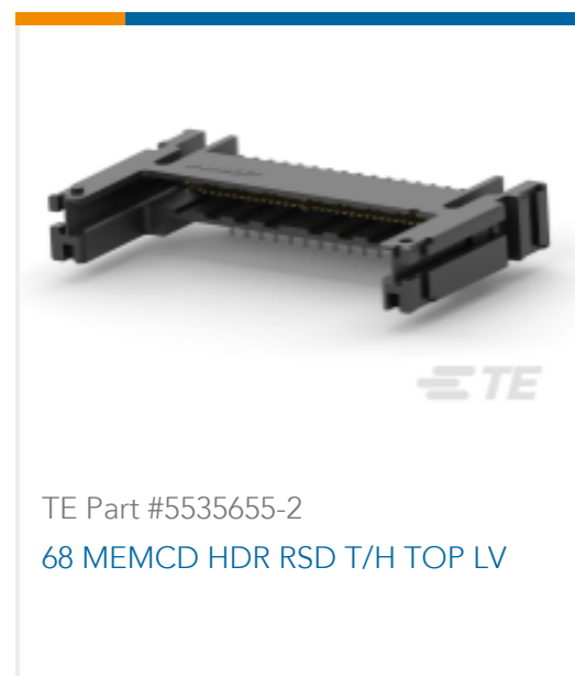
TE Part #5535655-2 68 MEMCD HDR RSD T/H TOP LV