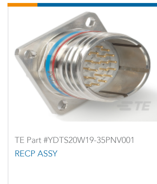
TE Part #YDTS20W19-35PNV001 RECP ASSY