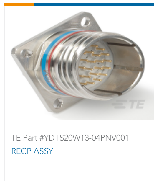
TE Part #YDTS20W13-04PNV001 RECP ASSY