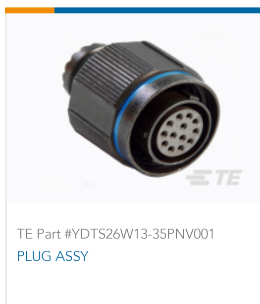
TE Part #YDTS26W13-35PNV001 PLUG ASSY