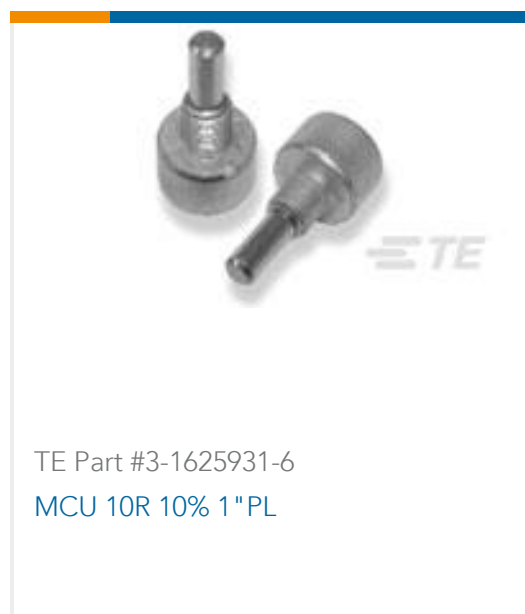
TE Part #3-1625931-6 MCU 10R 10% 1" PL