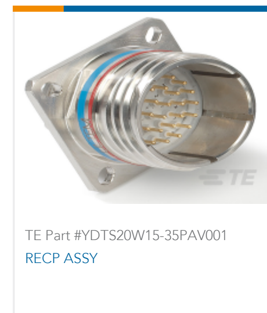
TE Part #YDTS20W15-35PAV001 RECP ASSY