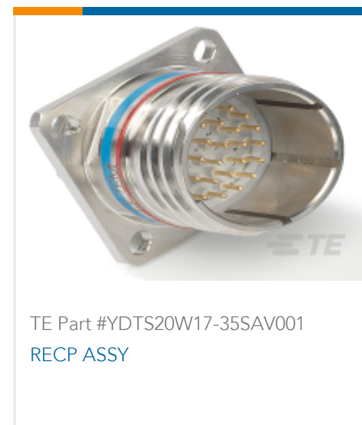
TE Part #YDTS20W17-35SAV001 RECP ASSY