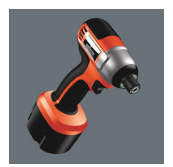
For use with impact screwdrivers. Improve productivity when screwdriving with power tools.