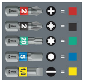
"Take it easy" tool finder with colour coding according to profiles and size stamp – for simple and rapid accessing of the required tool.

Hexagon socket screws are a problem, because the contact surfaces that transfer the force of the tool to the screw are very narrow. The consequence: the head of the screw can be damaged, usually rounding out the recess. Hex-Plus tools have larger contact surfaces to prevent this, driving from the flats of the recess, rather than the corners. Good to know: Hex-Plus tools fit into every standard hexagon socket screw!