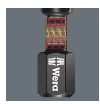
Torsion zone specially designed to absorb such forces and thereby protect the bit tip.