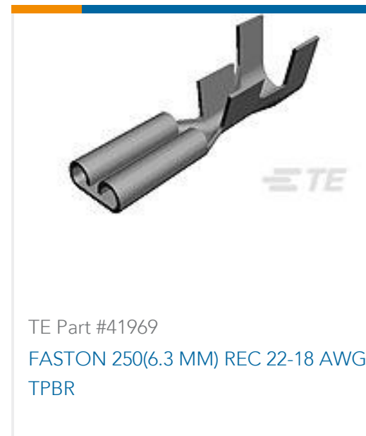
TE Part #41969 FASTON 250(6.3 MM) REC 22-18 AWG TPBR