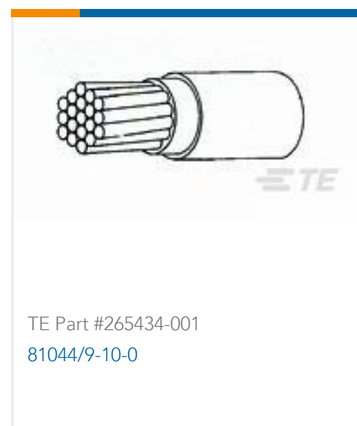
TE Part #265434-001 81044/9-10-0