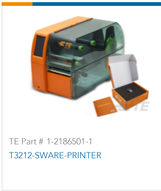
TE Part # 1-2186501-1 T3212-SWARE-PRINTER