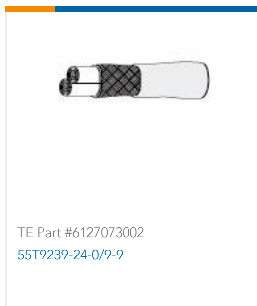
TE Part #6127073002 55T9239-24-0/9-9