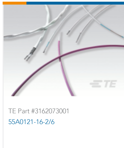
TE Part #3162073001 55A0121-16-2/6