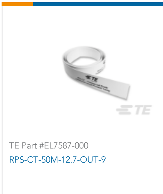
TE Part #EL7587-000 RPS-CT-50M-12.7-OUT-9