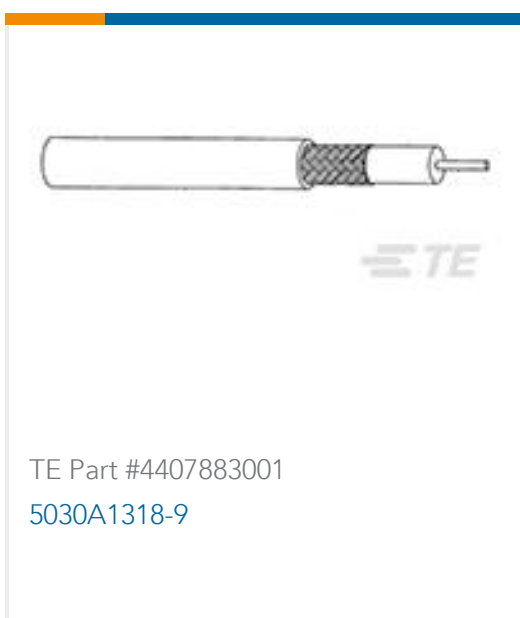
TE Part #4407883001 5030A1318-9