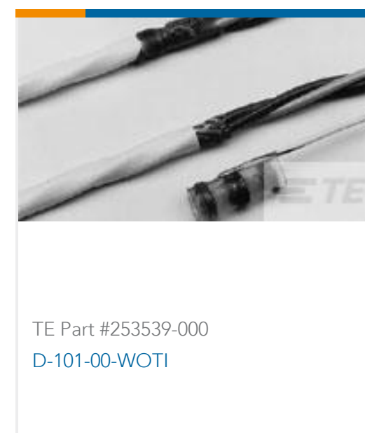
TE Part #253539-000 D-101-00-WOTI