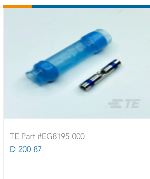
TE Part #EG8195-000 D-200-87