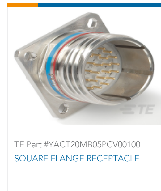
TE Part #YACT20MB05PCV00100 SQUARE FLANGE RECEPTACLE