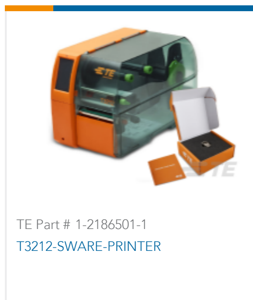
TE Part # 1-2186501-1 T3212-SWARE-PRINTER