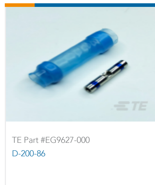
TE Part #EG9627-000 D-200-86