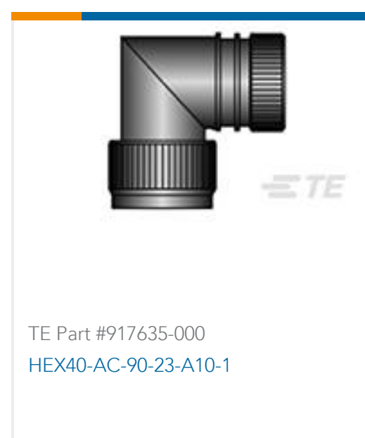
TE Part #917635-000 HEX40-AC-90-23-A10-1