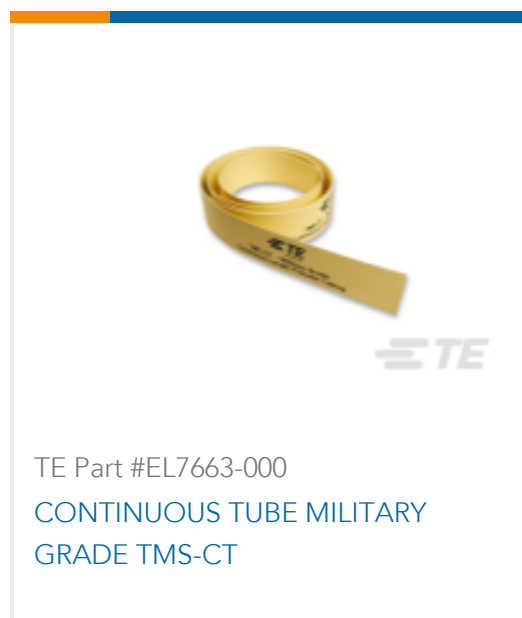
TE Part #EL7663-000 CONTINUOUS TUBE MILITARY GRADE TMS-CT