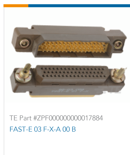
TE Part #ZPF000000000017884 FAST-E 03 F-X-A 00 B