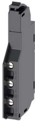
AUXILIARY SWITCH CHANGEOVER CONTACTS TYPE HQ (7MM) ACCESSORY FOR 3VA-BREAKER