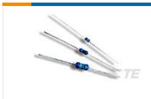
TE Model / Part #1622296-1 LR1 1% 100K