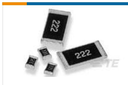
TE Model / Part #1623525-1 CRG1206 1% 4K7