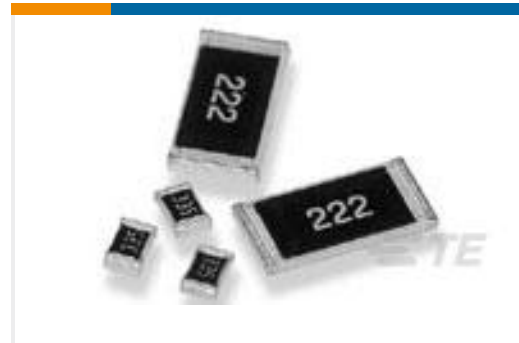
TE Model / Part #1623440-1 CRG1206 1% 1K0