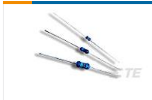
TE Model / Part #1622349-1 LR1 1% 1K0