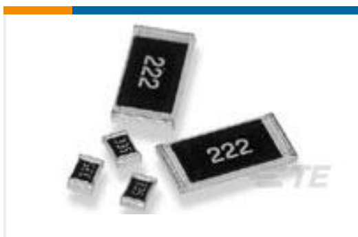
TE Model / Part #1623402-1 CRG1206 1% 100K