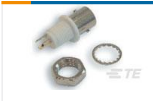
TE Model / Part #5-1634504-1 BNC Ins BHSkt 50Ohm Nickel Gold Pltd