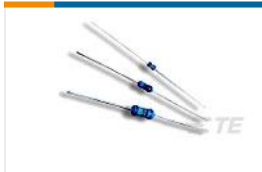
TE Model / Part #1622298-1 LR1 1% 10K