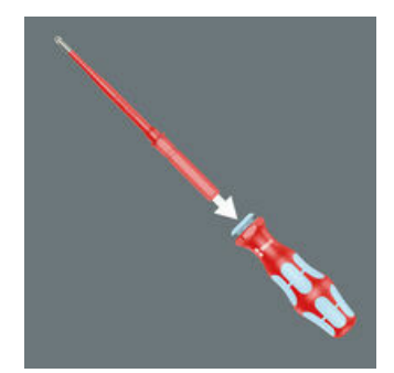
The VDE-insulated Kraftform Kompakt stainless blades are suitable for the 3817 VDE Stainless handle.