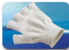
Cotton mittens gloves CG-81