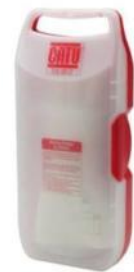
Gloves box CG-35/2