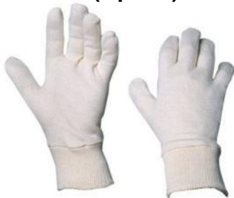
Cotton under-gloves CG-80