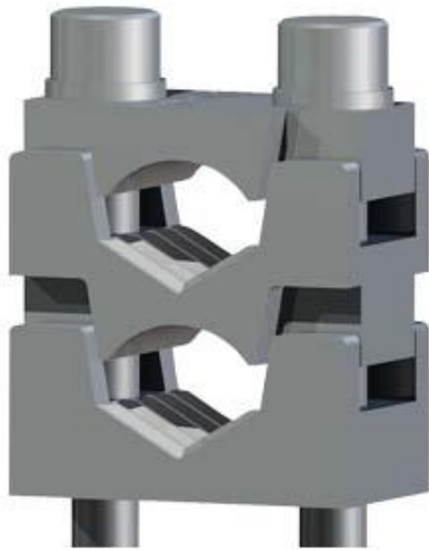
ACCES.F.FUSE SWI. DISCONNECTOR FOR NH3 PRISM TERMINAL, DOUBLE