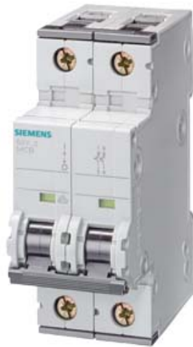
CIRCUIT BREAKER 400V 15KA, 2-POLE, B, 20A, D=70MM