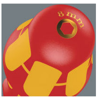
The screw symbol and tip size identification markings on the handle make it easier to find the right screwdriver in the tool case or at the workplace.