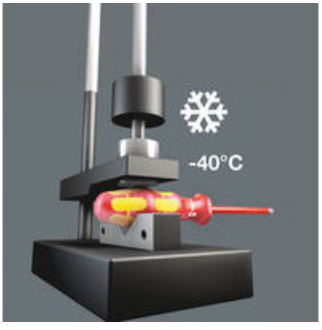
Impact strength tested at -40^{\circ} C, guaranteeing safety even under extreme conditions.