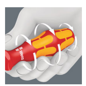
The hard materials used for the handle ensure rapid hand repositioning without any danger of the skin "sticking" to the handle. The surrounding hard zones with large diameters glide like wheels across the hand.