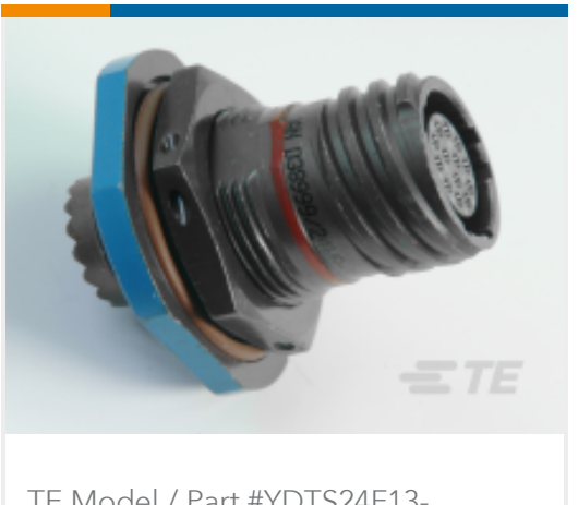
TE Model / Part #YDTS24F13-35SNC001 RECP ASSY