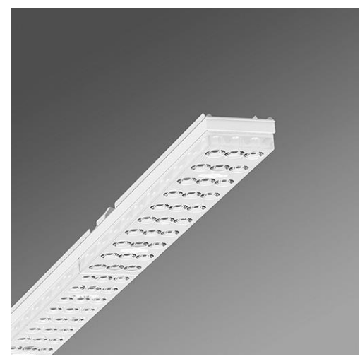
Lighting technology Individual.Lens.Optic-direct wide distribution SDGSOB LED 8000 Im 840