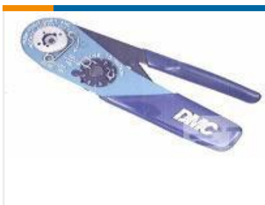
TE Part # 601966-1 CRIMPING TOOL M22520/2-01