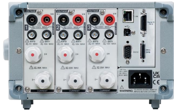
GPM-8330 with opt. GPM-DA12