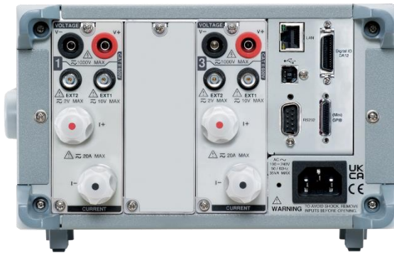
GPM-8320 with opt. GPM-DA12