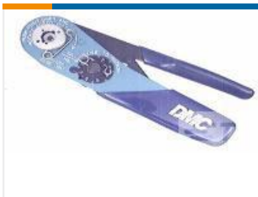
TE Part # 601966-1 CRIMPING TOOL M22520/2-01