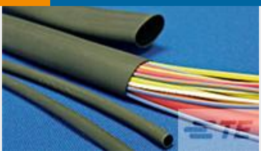
TE Part #1366094002 NETM1000-10-0-SP