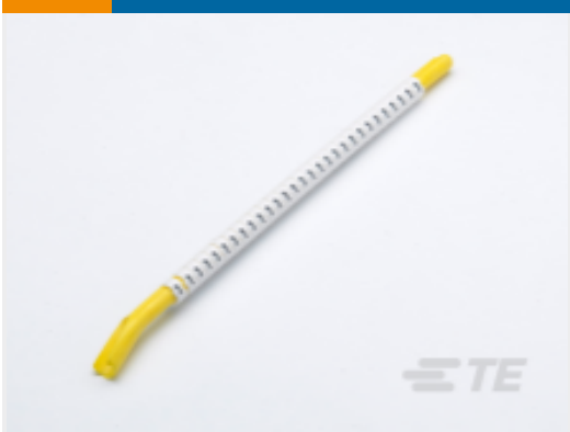
TE Part #1768045-9 STD SNAP-ON MARKERS