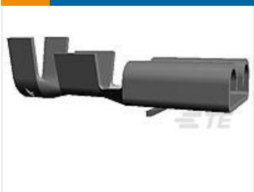
TE Part #160811-8 FF 250 REC 4-6MM2 PB