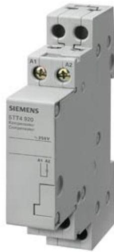
COMPENSATOR FOR REMOTE SWITCH 5TT41.. FOR GLOW LAMP CURRENT 20MA