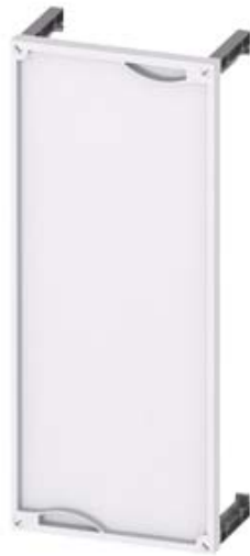
ALPHA 400/630 DIN, KIT SPACE COVER WITH SUPPORT H=600 W=250