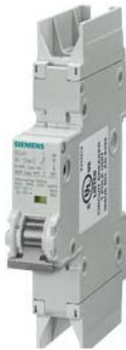
CIRCUIT BREAKER 10KA, 1POLE, D, 15A ACC. TO UL 489 - 277V