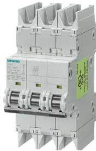
CIRCUIT BREAKER 10KA, 3POLE, C, 35A ACC. TO UL 489 - 480Y/277V