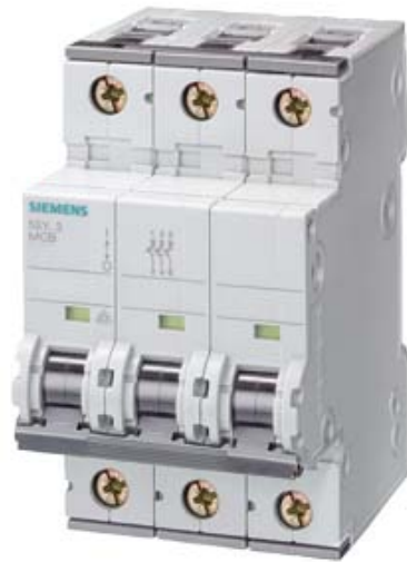
CIRCUIT BREAKER 400V 15KA, 3-POLE, B, 20A, D=70MM