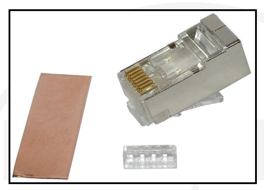
Category 6/6A Shielded Modular Plug (PXcat6S8XL)