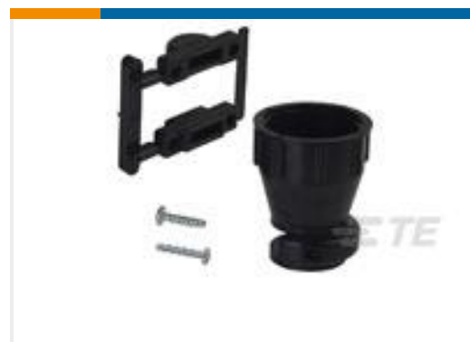
TE Part #206070-8 CABLE CLAMP KIT #17