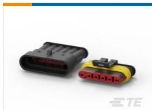
TE Part #282104-1 AMP SUPERSEAL 1.5MM, CONNECTOR HOUSING