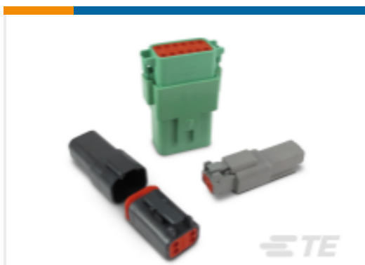
TE Part #DT04-2P DEUTSCH DT Series Housings & Connectors