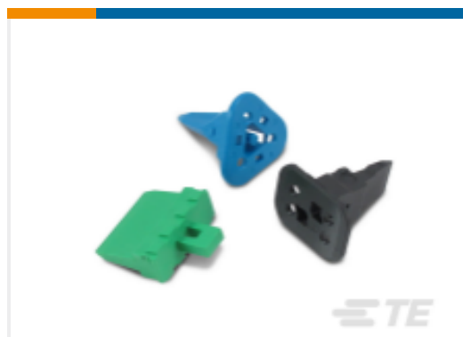
TE Part #W2S DEUTSCH DT WEDGELOCKS