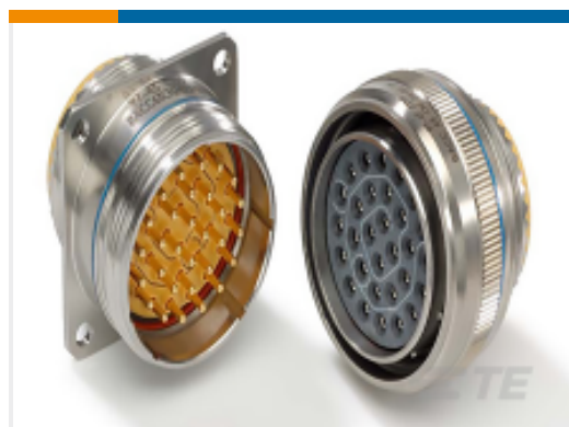
TE Part #ZPF0000000000007174 983-ORS 08-98 PN