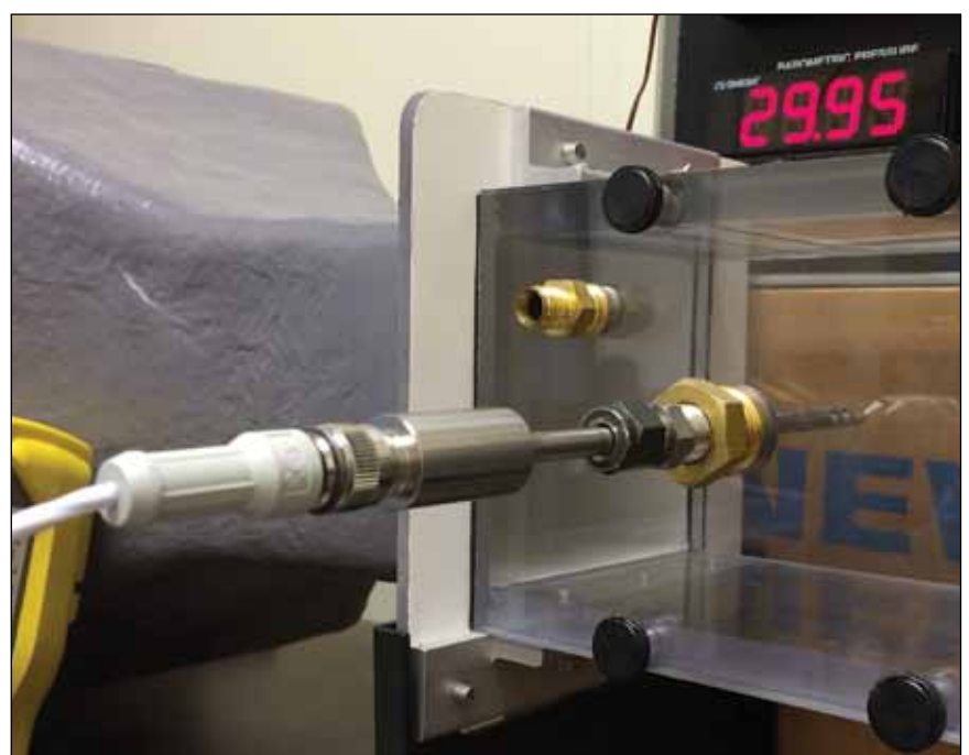
PR-25AP-A-1200-0-M12, shown with M12C-SIL-4-R-F-1.5.