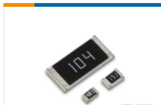
TE Part #1-2176341-7 CRGCQ 0805 220R 1%