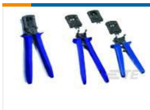
TE Part #1-1579004-2 CSV10 CRIMPING HANDTOOL SOLARLOK 4-6