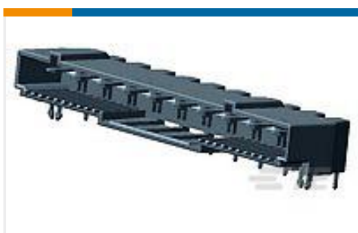
TE Part #1-2229803-1 D3950 HDR 11POS 1ROW X KEY