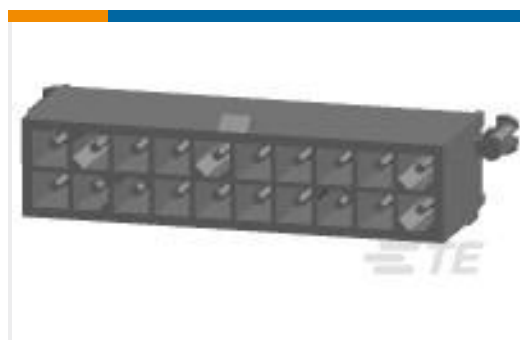
TE Part #1-794070-1 20P MINI UMNL HDR W/DH AU LF