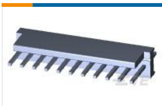
TE Part #1-640454-1 11P MTA100 HDR ASSY SQ STR POL