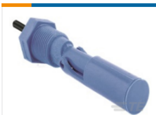
TE Part #80052-000 LS309-31 Liquid Level Sensor