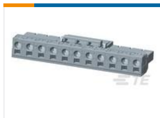
TE Part #1-2229794-1 D3950 REC 11POS 1ROW X KEY MARKED