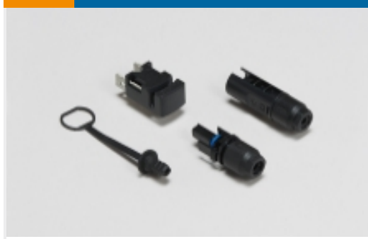
Solar Connectors & Adapters(32)