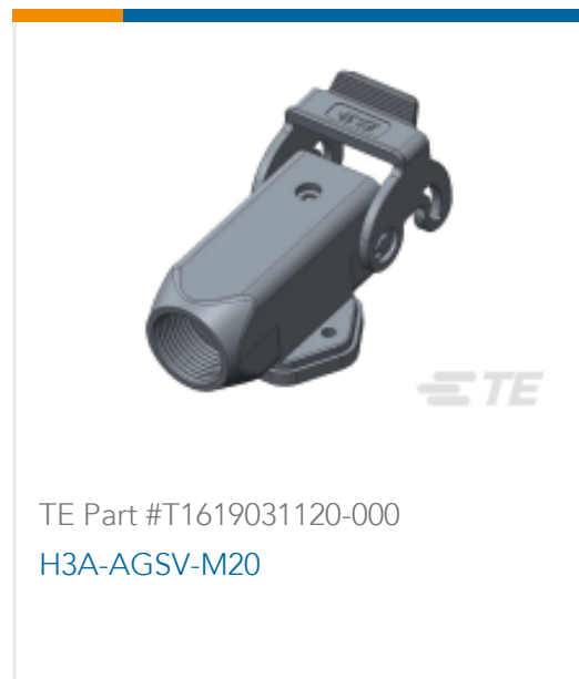
TE Part #T1619031120-000 H3A-AGSV-M20