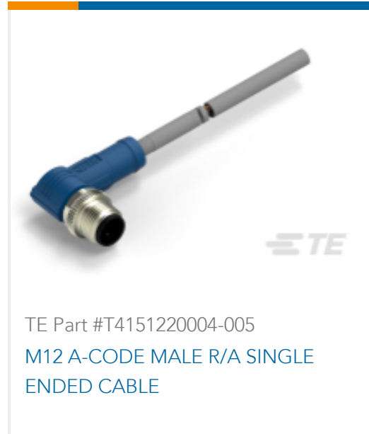
TE Part #T4151220004-005 M12 A-CODE MALE R/A SINGLE ENDED CABLE