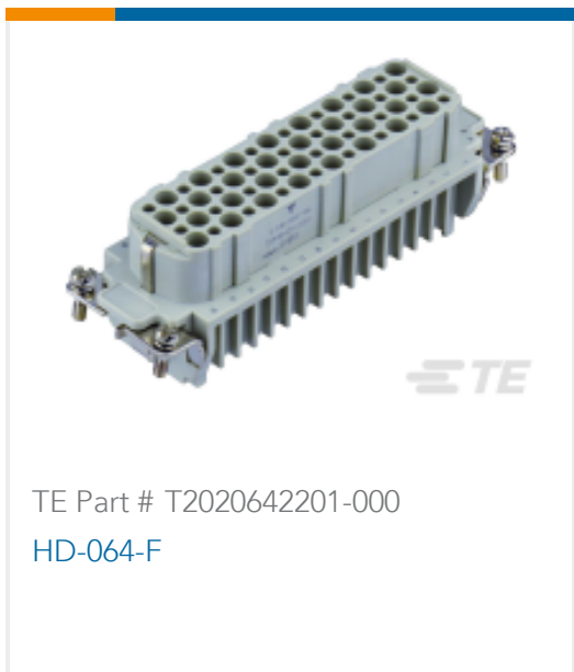
TE Part # T2020642201-000 HD-064-F