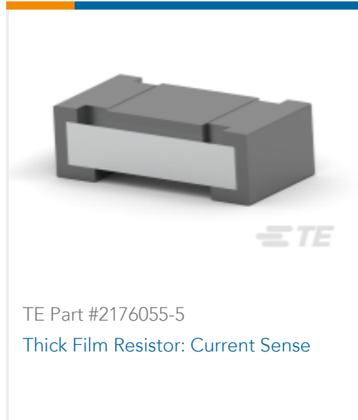
TE Part #2176055-5 Thick Film Resistor: Current Sense