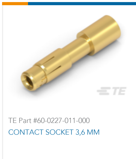
TE Part #60-0227-011-000 CONTACT SOCKET 3,6 MM