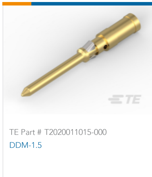
TE Part # T2020011015-000 DDM-1.5