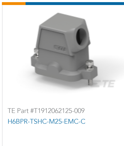
TE Part #T1912062125-009 H6BPR-TSHC-M25-EMC-C