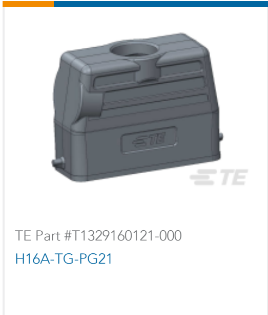
TE Part #T1329160121-000 H16A-TG-PG21