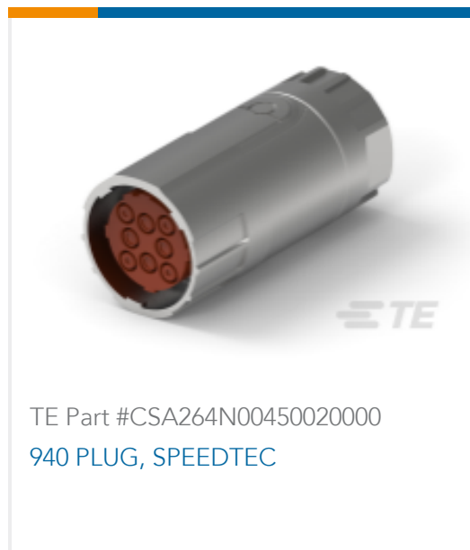
TE Part #CSA264N00450020000 940 PLUG, SPEEDTEC