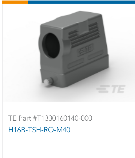
TE Part #T1330160140-000 H16B-TSH-RO-M40