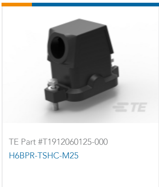
TE Part #T1912060125-000 H6BPR-TSHC-M25