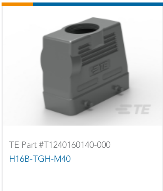
TE Part #T1240160140-000 H16B-TGH-M40