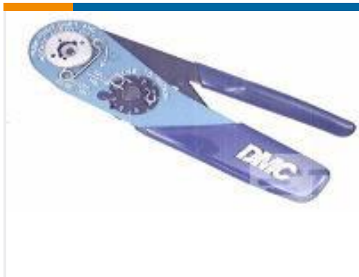
TE Part # 601966-1 CRIMPING TOOL M22520/2-01