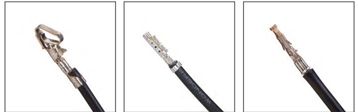
KK L1NK 396 Mega-Fit