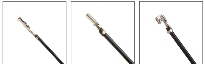
C-Grid III CLIK-Mate DuraClik