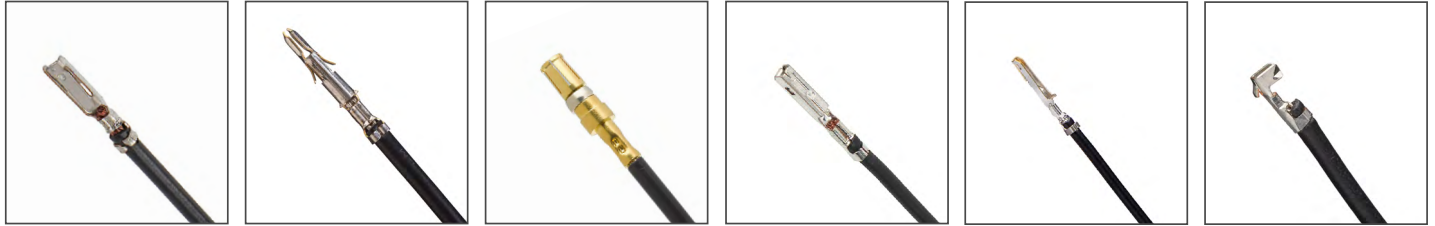
Mizu-P25 MLX MultiCat MX150 Nano-Fit PicoBlade