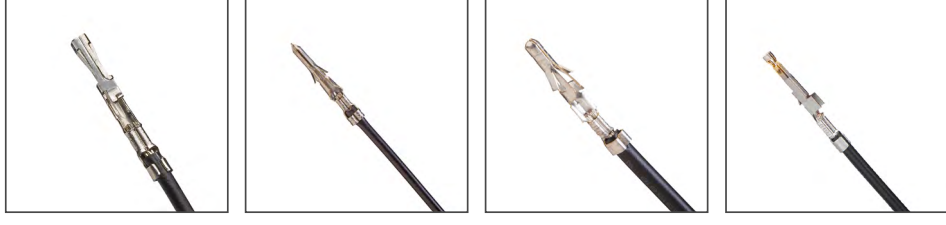
SL Standard .062" Standard .093" Ultra-Fit