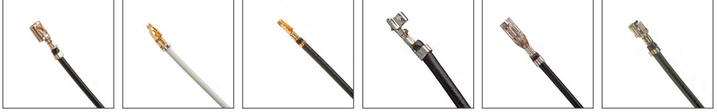
Pico-Clasp Pico-EZmate Pico-Lock Pico-SPOX Sabre Sherlock