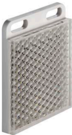
Part no.: 50113309 TKS 50x50.1.HT Reflector