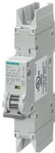
CIRCUIT BREAKER 10KA, 1POLE, D, 25A ACC. TO UL 489 - 277V