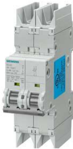
CIRCUIT BREAKER 10KA, 2POLE, D, 10A ACC. TO UL 489 - 480Y/277V