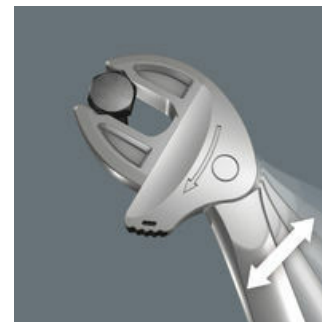
Joker 6004: Ratchet mechanism for fast work

The ratchet function in the mouth sees to fast and consistent screwdriving without removing the tool.